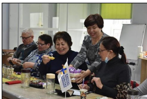
"Safe space" in Caritas Zaporizhzhia