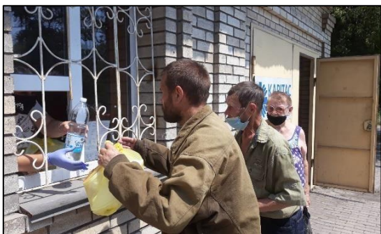
Soup kitchen in Mariupol

Below is a sample of CNEWA's 2022 projects in the country Medical equipment loan centre in Caritas Kharkiv →